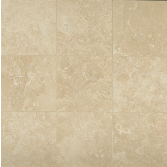
TRVDURANGO1818FH - 18"x18" Filled & Honed Bevel TRVDURANGO1836B - 18"x36" Brushed Straight Edge TRVDURANGO2424FH - 24"x24" Filled & Honed Bevel