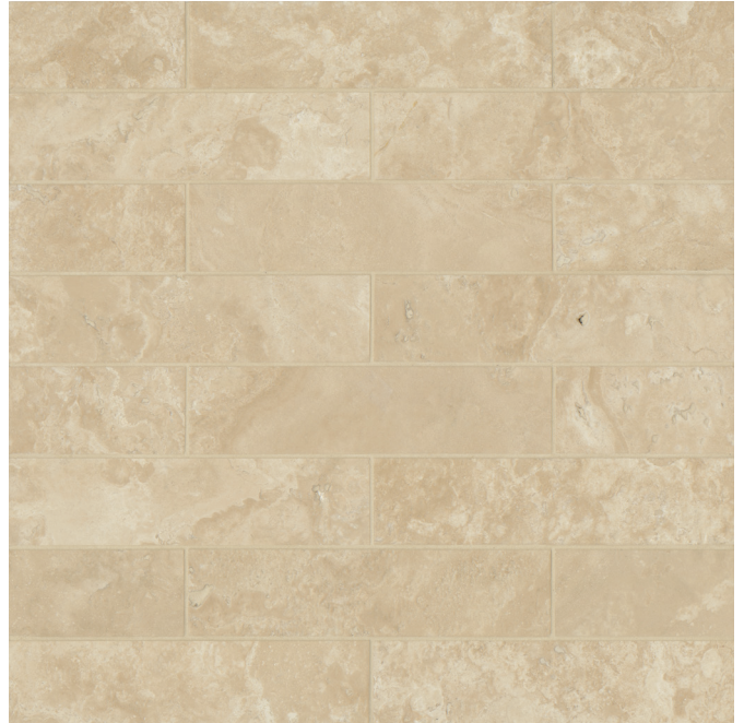
TRVDURANGO312B - 3"x12" Brushed Straight Edge