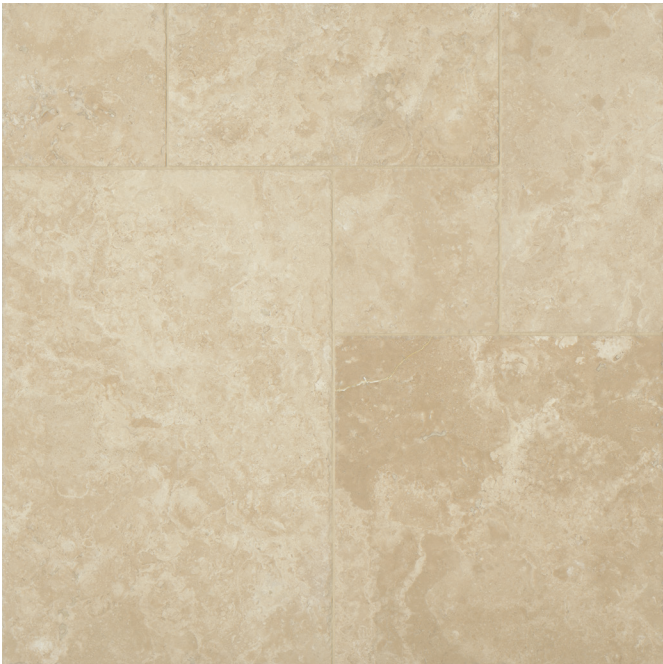
TRVDURANGOPAVSET - 3cm Paver Set - Tumbled (16 s/f set) TRVDURANGO1224PC5 - 24"x24" 3cm Paver - Tumbled