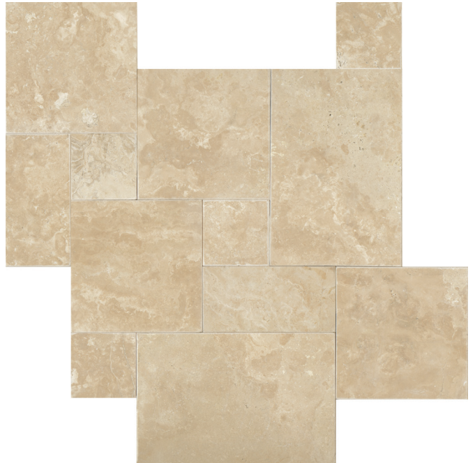
TRVDURANGOBUNDLE Versailles Pattern Bundle - Filled & Honed (8 sq ft per bundle)