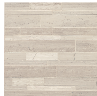
MRBASHGRYLNR Brentwood Linear Mosaic - Honed (12"x12" Sheet)