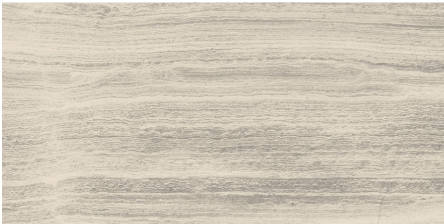
MRBASHGRYSLAB2HVC - 2 cm Slab Honed Vein-Cut MRBASHGRYSLAB2PVC - 2 cm Slab Polished Vein-Cut