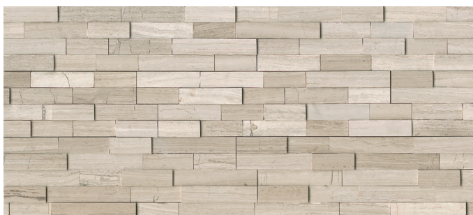
MRBASHGRYLED 6"x24" Ledger - Honed