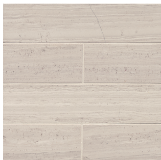
MRBASHGRY0312H 3"x12" - Honed