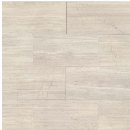
MRBASHGRY0624H - 6"x24" Honed MRBASHGRY0836H - 8"x36" Honed MRBASHGRY1224H - 12"x24" Honed