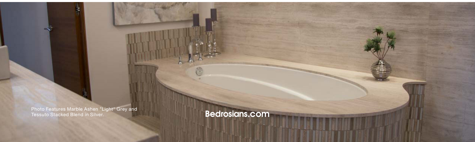
Photo Features Marble Ashen "Light" Grey and Tessuto Stacked Blend in Silver.