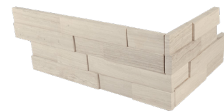
MRBASHGRYLEDCLR 6"x24" Ledger Corner - Honed