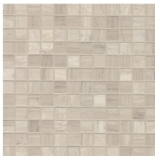
MRBASHGRY0101H 1"x1" Mosaic - Honed (12"x12" Sheet)