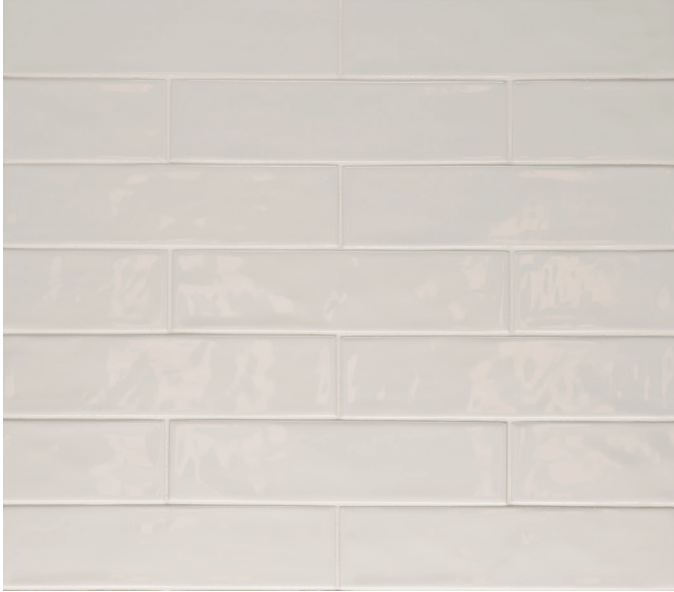
Grey 100000805 - 2 3/4"x11" Non-Rectified Wall Tile - Glossy 100000801 - 2 3/4"x11" Non-Rectified Wall Tile - Matte