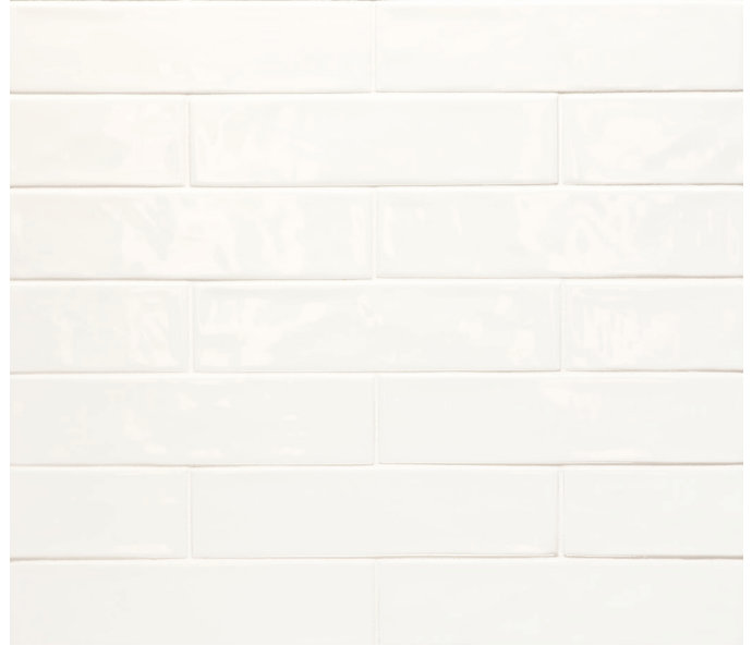
Ivory 100000804 - 2 3/4"x11" Non-Rectified Wall Tile - Glossy 100000800 - 2 3/4"x11" Non-Rectified Wall Tile - Matte