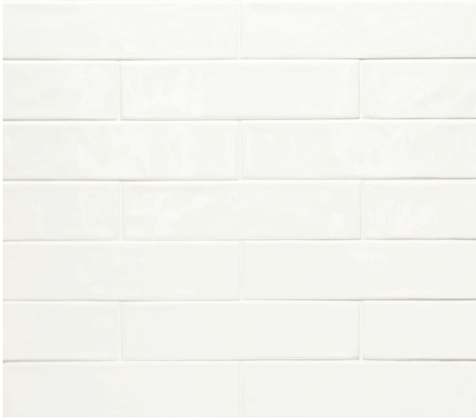
White 100000803 - 2 3/4"x11" Non-Rectified Wall Tile - Glossy 100000799 - 2 3/4"x11" Non-Rectified Wall Tile - Matte