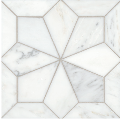
Bianco - BIA DECBLOBIA1212MO