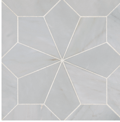
Grigio - GRI DECBLOGRI1212MO