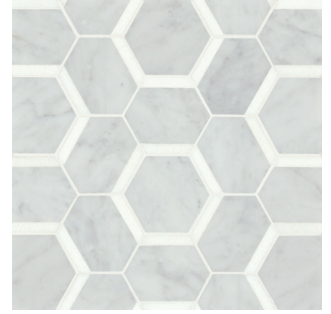
100001376 Mosaic 4 Blend - Honed (10 1/2"x12" Sheet)