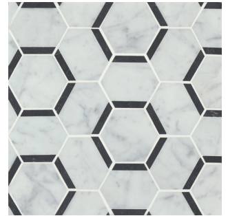
100001375 Mosaic 4 Blend - Honed (10 1/2"x12" Sheet)