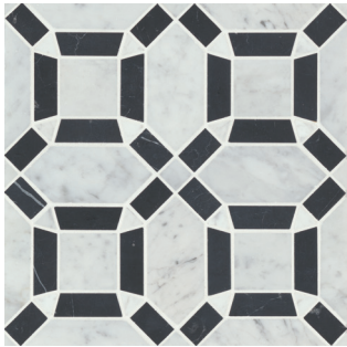
100001356 Mosaic 1 Blend - Honed (11 1/4"x11 1/4" Sheet)