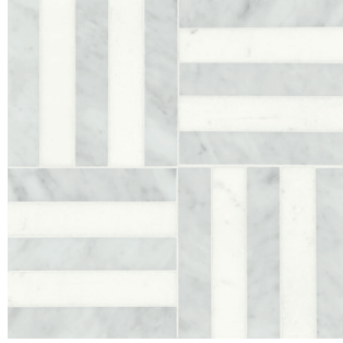
100001368 Mosaic 2 Blend - Honed (12 1/8"x12 1/8" Sheet)