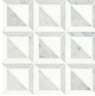
100001373 Mosaic 3 Blend - Honed (12 1/8"x12 1/8" Sheet)