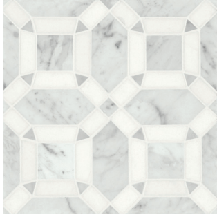
100001357 Mosaic 1 Blend - Honed (11 1/4"x11 1/4" Sheet)