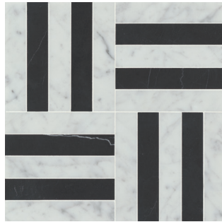
100001367 Mosaic 2 Blend - Honed (12 1/8"x12 1/8" Sheet)